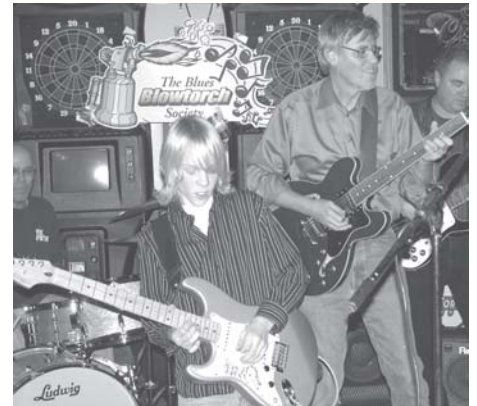
The young, the younger, the youngest