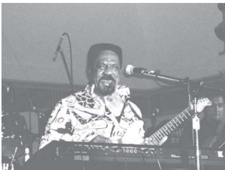
Ike Turner at Miss Valley Blues Fest July 2005