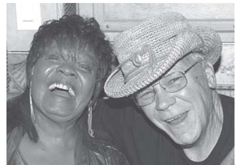
Frank Black and Koko Taylor