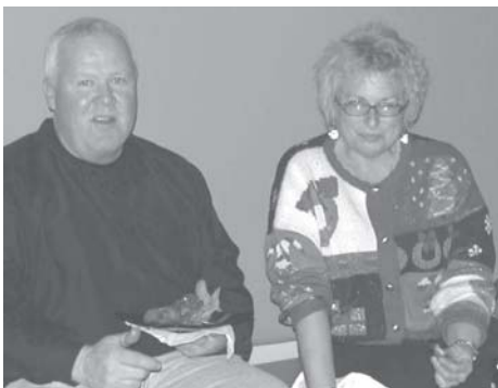
Enjoying NV Ultra Lounge

This is a do-not-miss event! Hey, it's Christmas, it's for charity, and the important officer elections are being held. Celebrate, don't abdicate!